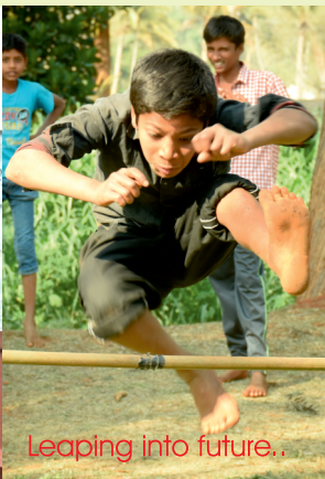
Leaping into future..

Become an active volunteer & derive inner joy.