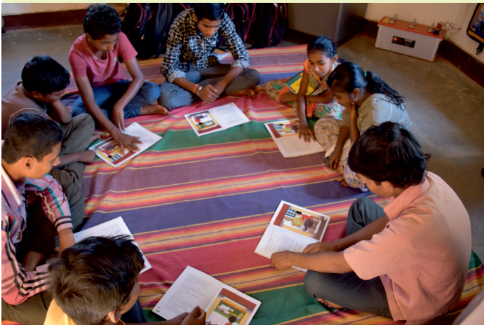
It's better to build children than to repair adults