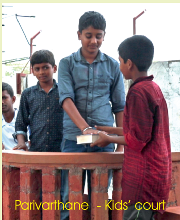
Parivarthane - Kids' court