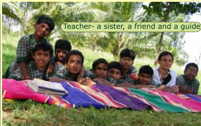
Teacher- a sister, a friend and a guide